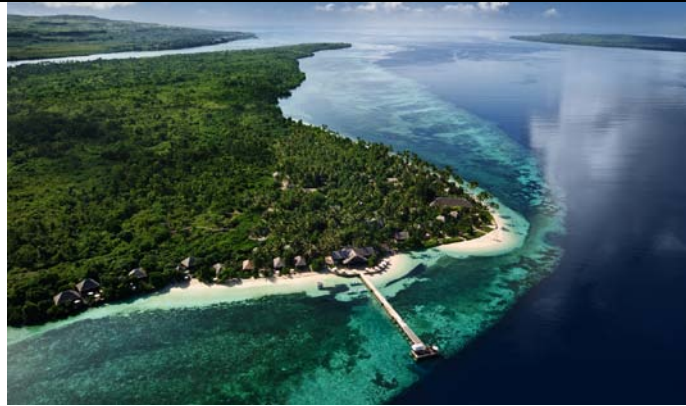
Aerial view of the resort with beach front and garden bures, luxury villas to the far left, and... that endless house reef !!