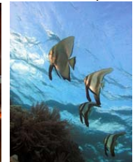
Several pygmy seahorse varieties; elegant dining area; one of many frog fish varieties; comfortable individual bungalows; many schools of fish: Batfish, humphead wrasse, barracudas, etc ; endless varieties of nudibranchs/shrimp/crabs; hatchery for lots of juvenals. Knowns as the epi-center for critter diversity.